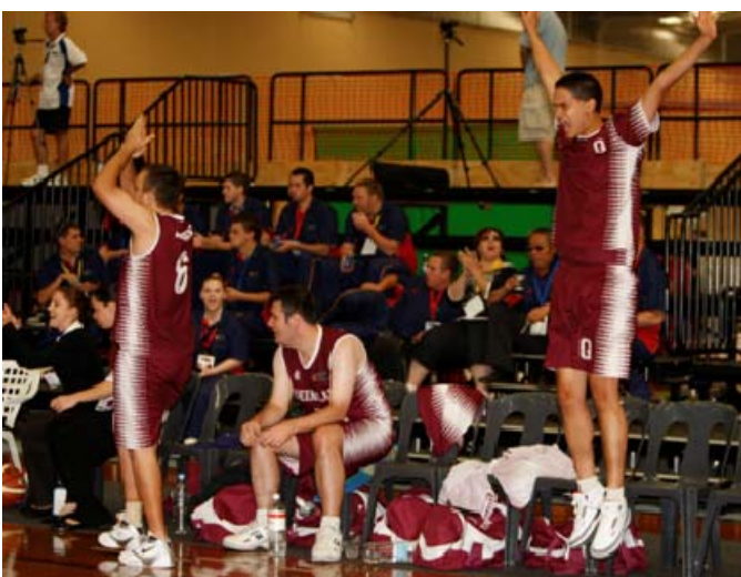
Queensland's bench celebrating during the 2010 Ivor Burge Championships.