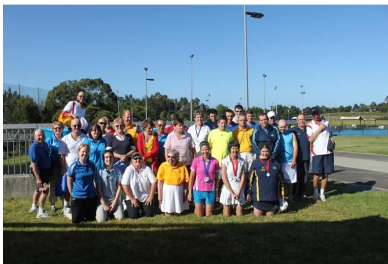
NSW Tennis Championships 15-16 October 2011

The 2012 Australian Tennis Championships are fast approaching and will be held from 25 January to 28 January at Albert Reserve and Melbourne Park for the finals.