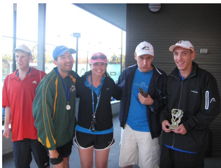
Queensland Tennis Championships 25-26 June 2011

2011 has been a successful year for our tennis players. The annual Australian Tennis Championships in January attracted a record number of participants and all players should be commended for their sportmanship on and off the court. Many players also enjoyed competing in the four State Tournaments conducted throughout the year in Victoria, Queensland, South Australia and New South Wales. Six talented athletes were rewarded for their strong tennis performances with selection in the Global Games team and achieved outstanding results.